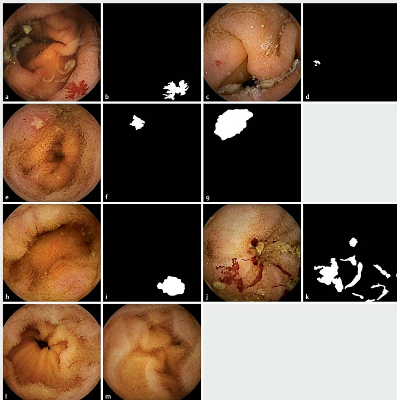
► Fig. 1 Examples of native small bowel capsule endoscopy frames, with their corresponding delimitations. a Native deidentified still frame showing a vascular lesion considered "highly relevant." b Manual delimitation of the vascular lesion within frame 1a. c Native deidentified still frame showing a vascular lesion considered "poorly relevant." d Manual delimitation of the vascular lesion within frame 1c. e Native deidentified still frame showing an ulcerative lesion (considered "highly relevant"). f Manual delimitation of the ulcerative lesion within frame 1e. g Manual delimitation of the ulcerative lesion including mucosal inflammatory changes within frame 1e. h Native deidentified still frame showing an ulcero-inflammatory lesion (considered "moderately relevant"). i Manual delimitation of the ulcero-inflammatory lesion within frame 1h. j Native deidentified still frame showing fresh blood (considered "highly relevant"). k Manual delimitation of the fresh blood within frame 1j. l, m Two normal control frames (no delimitation needed)

terminated yet in the literature. To overcome this limitation, our group is currently conducting a study based on an illustrated script questionnaire, aiming to better determine the clinical relevance of SB-CE findings. This study includes 576 frames with various types and numbers of findings, and different clinical