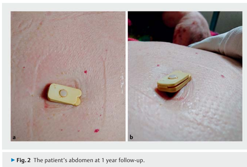
► Fig. 2 The patient's abdomen at 1 year follow-up.

Endoscopic sigmoidopexy with placement of a Chait catheter could be a promising method to prevent recurrence of sigmoid volvulus in patients with contraindication to surgery, as it provides not only bowel fixation but also allows on-demand colonic enemas or decompression.