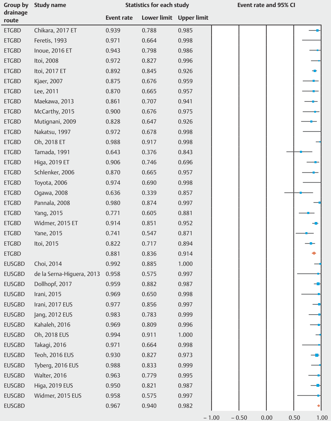
► Fig. 2 Clinical success rates of gallbladder drainage methods.