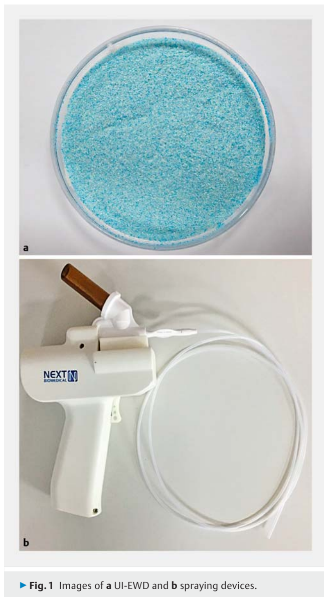
► Fig. 1 Images of a UI-EWD and b spraying devices.

clogging of the delivery catheter and impaired visualization due to formation of powder-in-air suspensions.