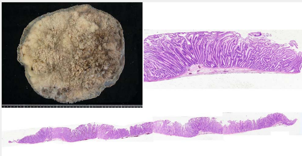
► Fig. 2 The resected specimen. Pathological examination showed an intramucosal adenocarcinoma in villous adenoma (size: 155×140 mm), which had been curatively resected with negative margins.