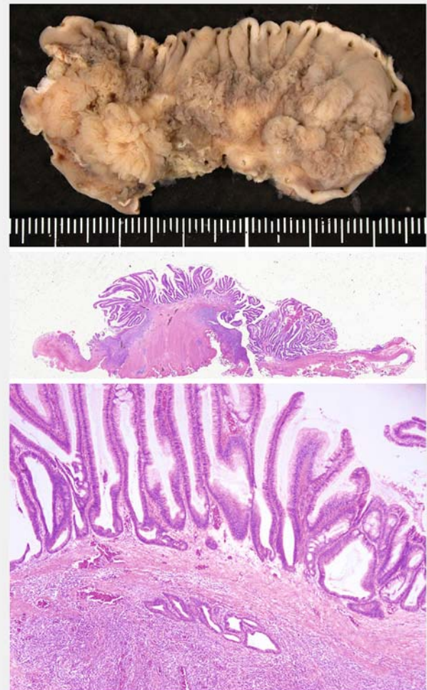
► Fig. 4 Pathological examination revealed a villous adenoma the same as the primary lesion with negative margins, but tumor cell nests were also present in the submucosa.

There have not been any signs of recurrence or stricture during the 9-year follow-up period (► Fig. 3 ).