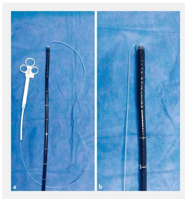
▶ Fig. 1 An inversely inserted snare in the endoscopic working channel. a A snare was inserted from the head end of the endoscope into the working channel. The length of insertion was approximately 30 mm. b The snare was soft and thin and could be efficiently attached to the endoscope.

We used a snare with an outer diameter of 1.8 mm (SD-221L-25, OLYMPUS, Japan) that was both soft and thin, which made it possible to inversely insert it into the endoscopic working channel (▶ Fig. 1 ) and then deliver it to the colon together with the endoscope (▶ Fig. 2a , ▶ Fig. 3a ). After the snare entered the colon and crossed the lesion, an endoclip was used to push the snare out of the endoscopic working channel to form a U-shaped loop in the front part of the snare (▶ Fig. 2b , ▶ Fig. 3b ), which was placed at the distal end of the lesion. The U-shaped loop prevented the snare from slipping out of the colon.