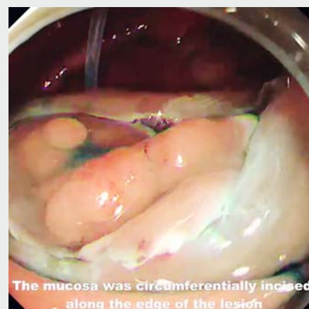
► Video 1 A laterally spreading tumor at the ascending colon resected with the aid of mucosal internal traction.