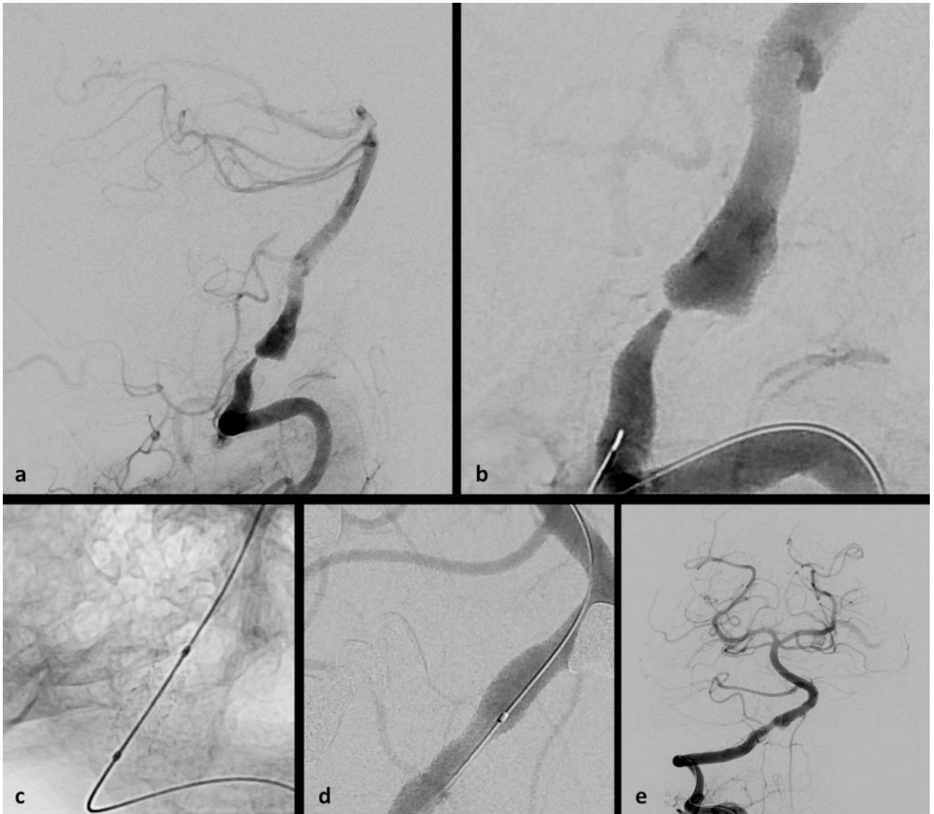
► Fig. 3 High-grade recurrent symptomatic hemodynamic stenosis of the distal V4 segment of the right vertebral artery with poststenotic ectasia and occlusion of the contralateral vertebral artery a, b . There is a wash-out phenomenon at the basilaris tip by competing supply via the posterior communicating arteries. The straight course of the stenosed segment allows unhindered navigation and implantation of a balloon-mounted stent (3.5/8 mm) c, d . Subsequent angiography shows a normalization of the flow up to the basilaris tip e ; the initial wash-out can no longer be observed due to the improved hemodynamics.

vascular occlusion remained unaffected by the exclusion of benefits, based on high-grade intracranial stenosis and in the absence or failure of alternative therapy concepts and in patients with a stenosis level of \geq 70\% , which after a stenosis-related infarction at least one more infarct was experienced despite subsequent intensive drug therapy. Patients with hemodynamic infarction patterns are not included in the overall Joint Federal Committee assessment as a group unaffected by the exclusion as they were not included in the existing studies. On the other hand, in their statement the professional associations point out that the indication for stent angioplasty can also be a useful and life-saving measure for hemodynamically-relevant vascular constrictions (► Fig. 2 ) [57].