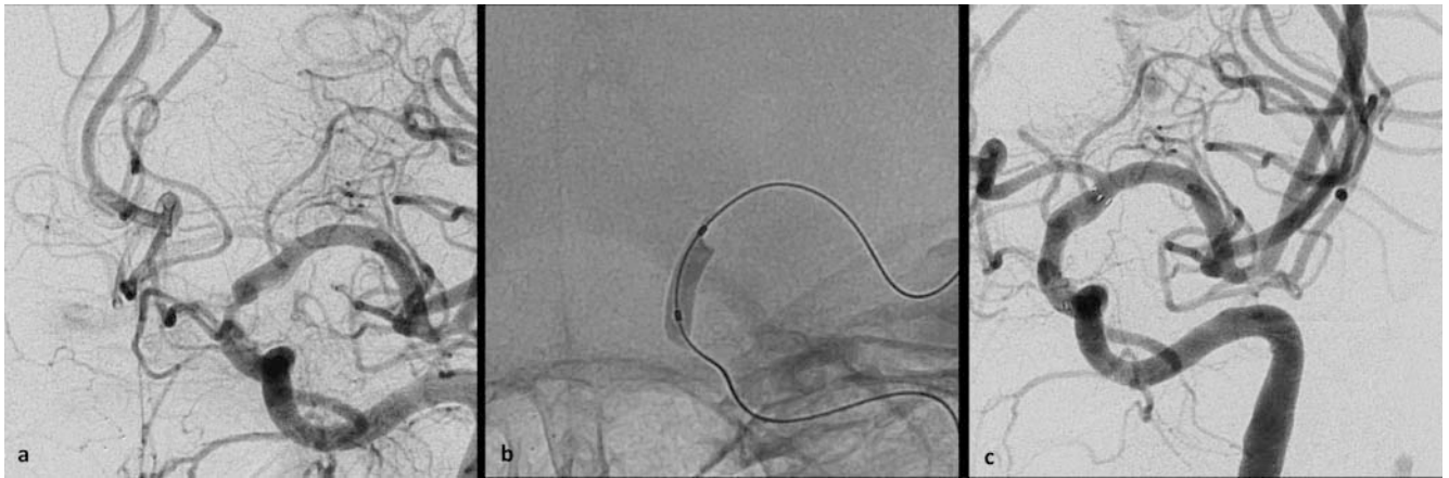
► Fig. 1 Symptomatic high-grade supraclinoid stenosis of the left internal carotid artery. Upper row: lateral projection, lower row: oblique projection (LAO). The stenosis affects the para-ophthalmic segment a and is dilated with a 3 mm balloon b . A self-expanding stent (3.5/15 mm) is implanted from slightly infra-ophthalmic to below the carotid T c . The ophthalmic artery, the posterior ramus, and the anterior choroid artery are covered by the stent without compromising flow.

to ICAS [47, 48]. In a retrospective comparison, the paclitaxel-coated Elutax DEB (drug-eluting balloon) (Aachen Resonance, Aachen, Germany) even showed a clear superiority over the Wingspan stent with respect to clinical recurrence and angiographic restenosis rate [49]. In a retrospective comparison of two drug-eluting stents (DES), 100 successful procedures showed a low restenosis rate of 3.6% exclusively after treatment with zotarolimus-coated Resolute Integrity™ (Medtronic Inc., Santa Rosa, CA, USA), and in no single case after treatment using paclitaxel-coated Taxus Element™ (Boston Scientific Corporation, Natick, MA, USA). The periprocedural complication rate was 9.9% and 3.0% for permanent disability [50]. Neither drug-coated balloons nor stents have been investigated in randomized trials in patients with ICAS.