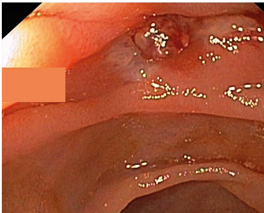
► Fig. 1 Image during single-balloon enteroscopy showing a pulsating Dieulafoy lesion in the distal jejunum.