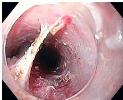
▶ Fig. 1 Submucosal tunnels were created covering the whole esophageal lumen.