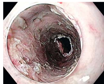
▶ Fig. 2 Ulcers were reassessed without muscular injury or bleeding.

formed. Three months later, the patient refused endoscopic re-evaluation but there was no unequivocal dysphagia. ESD is a well-established treatment for superficial esophageal SCC. However, for large circumferential lesions, ESTD has a more rapid dissection speed and higher R0 resection rate compared with conventional ESD [1–2]. Although widely performed in Asia, only a few cases have been described at Western centers [3–