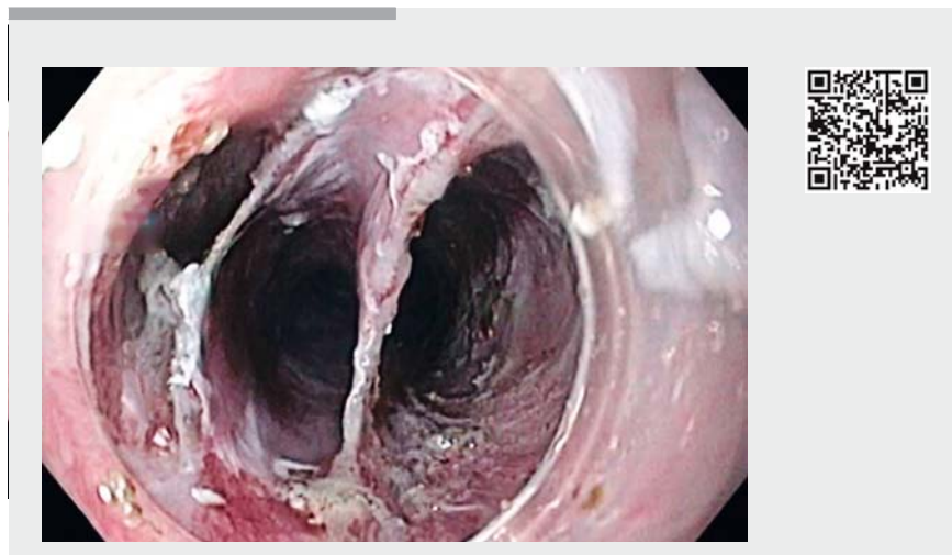
▶ Video 1 Endoscopic submucosal tunnel dissection for the treatment of synchronous esophageal neoplasms.

The procedure took 270 minutes and the patient was discharged 48 hours after the procedure under oral prednisolone. Pathological analysis revealed a well-differentiated squamous cell neoplasia (SCC), without lymphovascular invasion; the tumor was intramucosal and resection was complete in lesion A but submucosal invasion with positive vertical margins were present in lesion B. After multidisciplinary evaluation, chemoradiotherapy for both esophageal and oropharyngeal neoplasms was per-