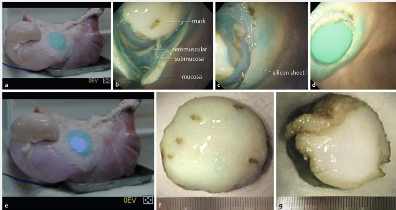
► Fig. 2 Sealed EFTR using non-woven gauze (ex vivo experiment). a Pasting of silicone sheet and gauze to the serosa using fibrinogen-thrombin solution. b, c Confirmation of each stomach layer and layer-by-layer incision. d, e Maintenance of the stomach in expanded state even after all-layer incision. f, g Resected specimen ( f , mucosal side; g , serosal side).

periment, polyglycolic acid (PGA) sheet (Neoveil; Gunze, Tokyo, Japan) was used instead of non-woven gauze.