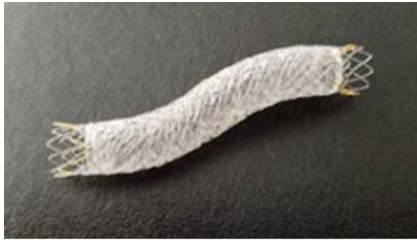
► Fig. 1 The double bare, partially covered, self-expandable metal stent (EGIS Biliary Stent; S&G Biotech Inc., Yongin-si, Korea).

Endoscopic ultrasound-guided hepaticogastrostomy (EUS-HGS) has been indicated for failed endoscopic retrograde cholangiopancreatography (ERCP) [1, 2]. Recently, to obtain a longer duration of stent patency or avoid adverse events, EUS-HGS combined with antegrade stenting (EUS-HGAS) has been reported [3, 4]. In this procedure, an uncovered, self-expandable, metal stent (UCSEMS) is usually used to avoid stent dislocation. However, compared with a fully covered, self-expandable, metal stent (FCSEMS), longer stent patency may not be achieved [5]. A novel, double bare, partially covered, self-expandable, metal stent (D-FCSEMS, EGIS Biliary Stent; S&G Biotech Inc., Yongin-si, Korea) (► Fig. 1 ) has become available in Japan. This stent has low axial force compared with conventional FCSEMS, and high radial force compared with conventional UCSEMS. Therefore, this stent may be suitable for EUS-HGAS. Herein, we describe technical tips for EUS-HGAS using the D-FCSEMS (► Video 1 ).