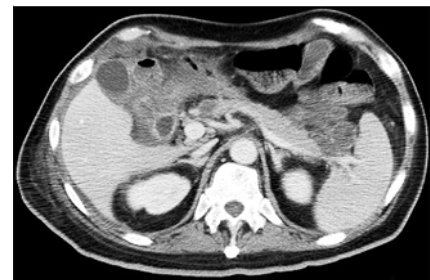
► Fig. 3 Follow-up contrast-enhanced abdominal computed tomography after four sessions of direct endoscopic necrosectomy.

Direct endoscopic necrosectomy (DEN) is a minimally invasive treatment option that has been introduced in recent years for the treatment of infected walled-off pancreatic necrosis (WON), and has been performed as an alternative to operative and percutaneous therapy [1–3]. An esophageal, fully covered, self-expandable, metal stent (FCSEMS) has a large diameter and can provide effective drainage for pancreatic collections. Both ends are flared, allowing apposition, preventing migration, and facilitating endoscope passage and debridement in the retroflexed position. Herein, we demonstrate technically and clinically successful treat-