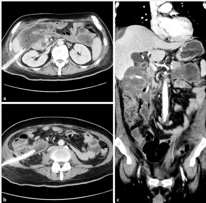
► Fig. 1 Contrast-enhanced abdominal computed tomography before treatment. a Previous subhepatic percutaneous drainage tube. b Previous percutaneous drainage tube in the right infrarenal space. c Coronal plane.