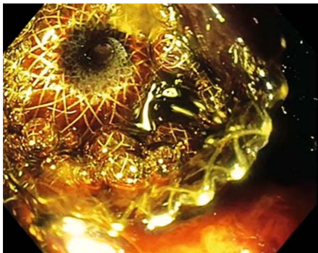
► Fig. 3 Endoscopic view of the lumen-apposing metal stent in the duodenum.