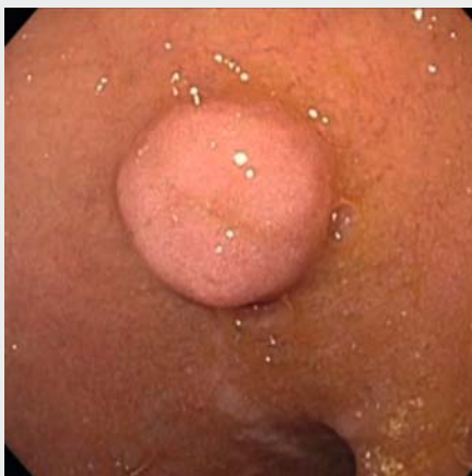
► Video 1 Endoscopic banding without resection (BWR) technique for treatment of diminutive neuroendocrine tumors in the duodenum.

Several endoscopic approaches have been reported for resection of duodenal NETs including EMR with or without band ligation and cap-assisted EMR, as well as ESD, an emerging technique requiring advanced technical expertise. However, both these modalities carry a significant risk of hemorrhage and perforation, with complication rates ranging from 18% to 40%, and a mortality rate of up to 3% [3–6]. Despite these risks, the chances of incomplete resection (R1) can be as high as 44% on EMR and 20% on ESD cases [5, 6]. These risks can be reduced by eliminating the use of electrosurgical resection, which can be accomplished with the use of the BWR technique. Despite the lack of electrosurgical current, BWR can also carry the risk of perforation even in the thick-walled stomach [17]. The BWR technique has been successfully reported for resec-