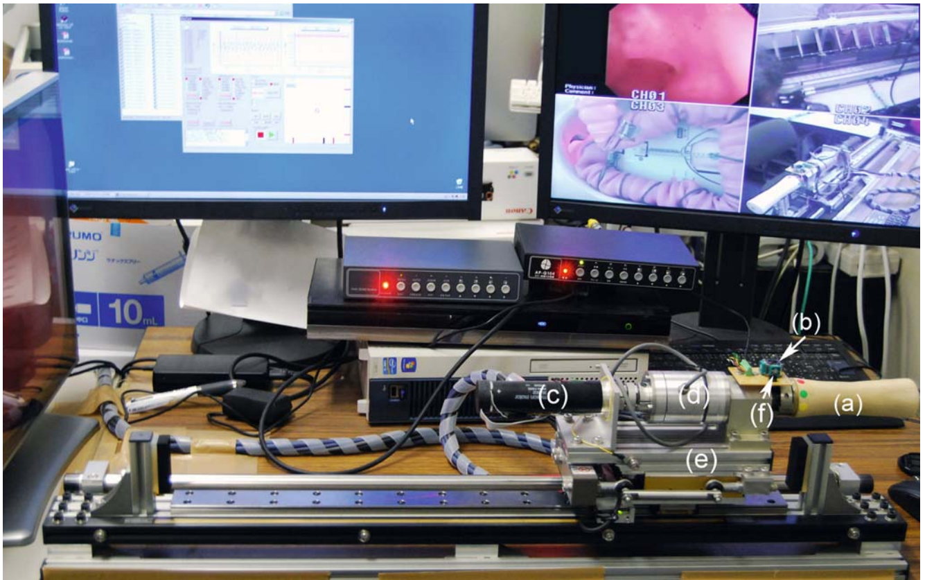
► Fig. 1 Components of master unit of EOR ver. 3. a Knob-like rotating part (a) (rotating knob). b Mini joystick. c Rotary motor. d Torque sensor. e Load cell. f Circuit switch.