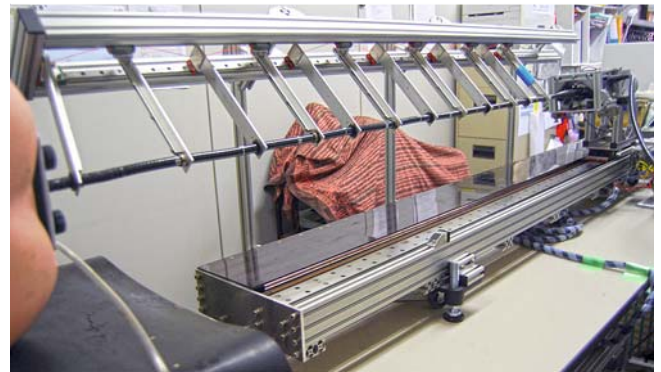
► Fig. 2 The slave unit of Endoscopic Operation Robot (EOR) ver. 3. to which the colonoscope (Olympus PCF-240; Tokyo, Japan) is attached.

The master unit of EOR ver. 3 (► Fig. 1 ) consists of a knob-like rotating part (a) (rotating knob), a mini joystick (b), a rotary motor (c), torque sensor (d), a load cell (e) and the circuit switch (f). The master unit is an original device that enables four-axis movement of the flexible endoscope with one hand to provide intuitive manipulation. In brief, an operating knob equipped with a knob-like rotating part (a) (rotating knob) is installed on a linear motor with a long axis of 60 cm. By operating the linear motor in the long-axis direction with the rotating knob, the scope is inserted or retracted; by rotating the rotating knob, the scope can be rotated. To enable force feedback in these two axes, a load cell (e) is attached to the linear motor, and a rotary motor (c) and torque sensor (d) are installed on the rotation knob. Up-down and left-right angulation are performed with the thumb or index finger using a mini joystick (b)