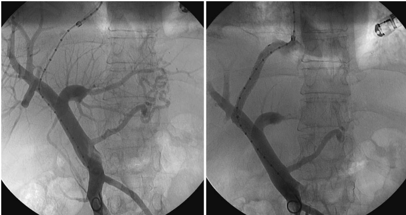
► Fig. 3 Left image: after a guidewire is introduced, the needle is exchanged for a calibrated catheter for diagnostic purposes and pressure measurements. Right image: Control study after TIPS placement and balloon dilatation.