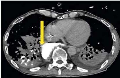
► Fig. 1 Contrast-enhanced axial computed tomography (CE-CT) scan showing a leak from the pull-up gastric conduit interponate to the right lung parenchyma (yellow arrow).