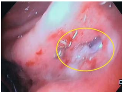
► Fig. 2 Endoscopic view showing the gastropulmonary fistula (yellow circle) along the longitudinal suture line of the pull-up gastric interponate.