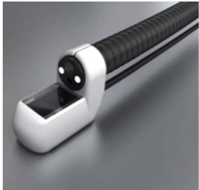
► Fig. 1 EndoVE. Images of the device used in the trial- EndoVE ® . The electrode is attached to an endoscope. Tumor tissue is captured in place within the chamber ( 1 \times 1 \times 1.5 cm) of the device by a vacuum; this brings the tumor in contact with the two parallel electrodes which deliver pulses in 100 \mu\text{s} intervals. The procedure is repeated until the whole tumor area is covered.

The protocol allowed for inclusion of eight patients. Since the primary endpoint was safety in this phase I first-in-man trial, the subject number was low. Only patients ineligible for potentially curative intended surgery were candidates. Inclusion criteria were: age \geq 18 years, histologically verified malignant esophageal tumor (adenocarcinoma or squamous cell cancer), expected survival time \geq 3 months, WHO performance status \leq 2 [18], platelets \geq 50 billion/L, International Normalized Ratio < 1.5 (medical correction was allowed), and s-creatinine < 150 \mu\text{mol/L} . Moreover, patients had to have locally progressive disease despite previous treatment with chemoradiotherapy or locally progressive disease despite previous treatment with palliative radiotherapy and not be candidates for systemic chemotherapy. Written informed consent was required. Exclusion criteria were: non-correctable coagulation disorders, clinically significant cardiac arrhythmias, pregnancy or lactation/breast-feeding, concurrent treatment with another investigational medicinal product, contraindications for use of bleomycin (acute pulmonary infection, severe pulmonary disease, previously allergic reactions to bleomycin, or a previously regimen