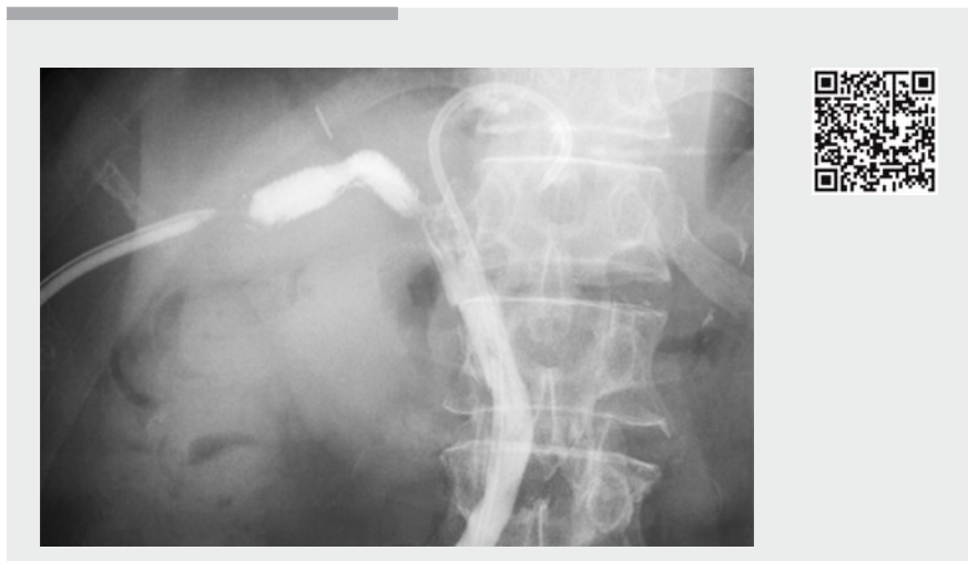
► Video 1 Magnetic compression anastomosis for biliary obstruction following partial hepatectomy, after failure of recanalization by means of endoscopic retrograde cholangiopancreatography and percutaneous transhepatic biliary drainage.

(► Fig. 3 ). Then, the outer sheath with the magnet was inserted via the papilla and the magnet was pushed out using biopsy forceps. The magnets were ad-