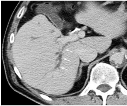
► Fig. 1 Dilatation of the right-posterior intrahepatic bile (arrows) seen at computed tomography (CT).

Magnetic compression anastomosis (MCA) is a revolutionary method of performing choledochocholedochostomy without surgery in patients with biliary obstruction [1–5]. Herein, we report the successful treatment, using MCA, of a case of complete biliary obstruction after partial hepatectomy.