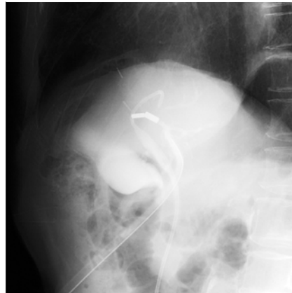
► Fig. 4 The two magnets attracted each other.