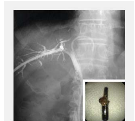
► Fig. 5 Recanalization was achieved (main figure) and the magnets were endoscopically removed (inset).

tic stent was placed via the transpapillary route in the left bile duct to prevent magnet migration. Recanalization was achieved 7 days after the procedure and the magnets were endoscopically removed using basket forceps, without adverse events (► Fig. 5 , ► Video 1 ). The created fistula was dilated using a 10-Fr biliary dilation catheter over the guidewire. Finally, a fully covered self-expandable metal stent (BonaStent M-intra-ductal; Standard Sci Tech, Seoul, South Korea) was placed in the right bile duct across the fistula (► Video 1 ).