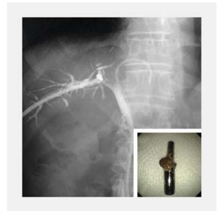
► Fig. 5 Recanalization was achieved (main figure) and the magnets were endoscopically removed (inset).

tic stent was placed via the transpapillary route in the left bile duct to prevent magnet migration. Recanalization was achieved 7 days after the procedure and the magnets were endoscopically removed using basket forceps, without adverse events (► Fig. 5 , ► Video 1 ). The created fistula was dilated using a 10-Fr biliary dilation catheter over the guidewire. Finally, a fully covered self-expandable metal stent (BonaStent M-intra-ductal; Standard Sci Tech, Seoul, South Korea) was placed in the right bile duct across the fistula (► Video 1 ).