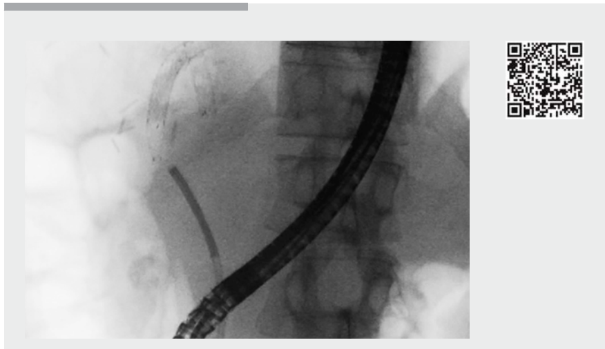
► Video 1 Stent–stone complex seen at the distal stent end on insertion of the digital intraductal cholangioscope into the bile duct. Electrohydraulic lithotripsy was performed, with subsequent visualization of the stent lumen. The guidewire was then inserted under cholangioscopic guidance.

Following insertion of a digital intraductal cholangioscope (SpyGlass DS; Boston Scientific Corp., Marlborough, Massachusetts, USA) into the bile duct, it was found that a stent–stone complex had formed at the distal stent end, and the lumen of the stent was completely obstructed (► Fig. 2 ). Therefore, electrohydraulic lithotripsy was performed for the stent–stone complex. Thereafter, the lumen was visualized, and the guide-