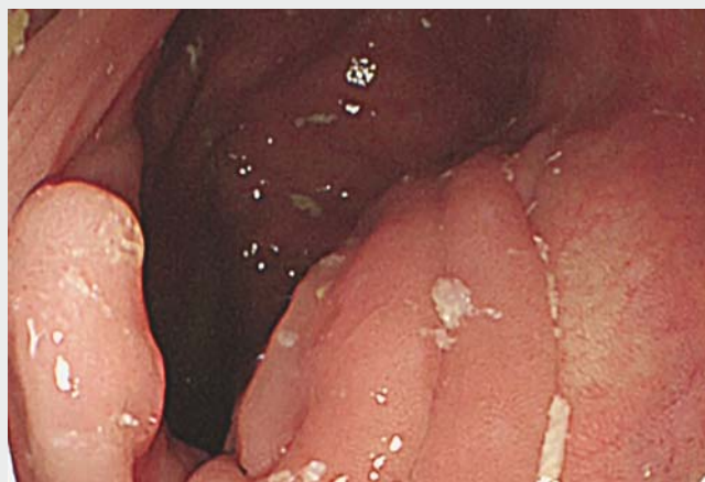
► Video 1 An Endocuff was placed on the top of the endoscope to allow the lesion to be viewed using forward observation. The water-filling process was effective in helping to acquire better visualization and allowing the lesion to be grasped with a snare.

We conclude that underwater polypectomy using Endocuff assistance to treat neoplasms located only in the hepatic or splenic flexure may be considered an effective method for endoluminal treatment of complex lesions.