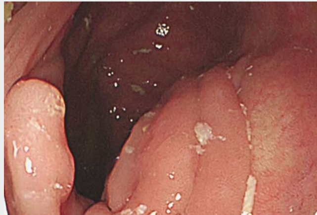
► Video 1 An Endocuff was placed on the top of the endoscope to allow the lesion to be viewed using forward observation. The water-filling process was effective in helping to acquire better visualization and allowing the lesion to be grasped with a snare.

We conclude that underwater polypectomy using Endocuff assistance to treat neoplasms located only in the hepatic or splenic flexure may be considered an effective method for endoluminal treatment of complex lesions.