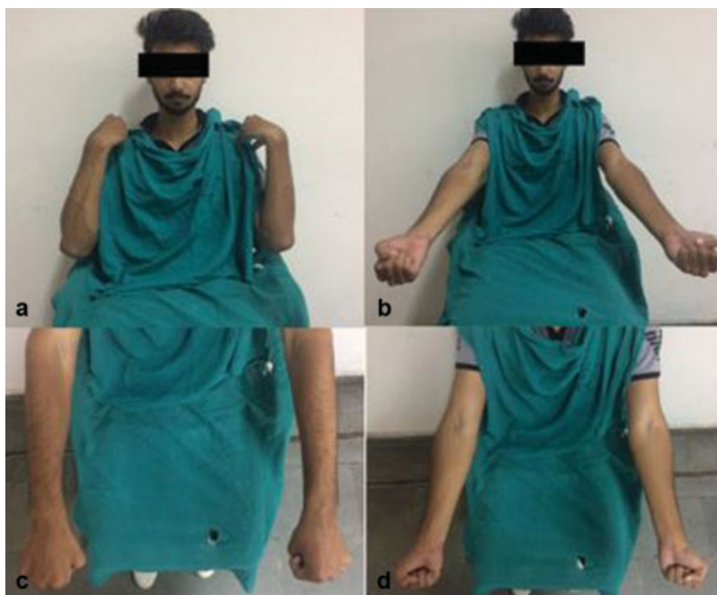
Fig. 5 At 12 months, range of motion; (a) flexion, (b) extension, (c) supination, (d) pronation.

Diagnosing and reducing the dislocation promptly is of utmost importance. There are some complications associated with this injury, like stiff elbow, recurrent radial head instability, and problems associated with Kirschner wire fixation. Recurrent radial head instability is addressed based on the congruence of the radial head reduction. If the radial head can be congruously reduced, annular ligament reconstruction is