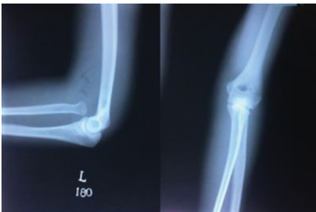
Fig. 1 Anteroposterior and lateral radiographs of the left elbow showing isolated anterior radial head dislocation.

An 18-year-old male college student, who sustained an injury to his left elbow during a wrestling match at a sports academy. He fell down backwards on an outstretched hand with the wrist in dorsiflexion. He complained of pain and swelling on the anterior aspect of the left elbow, and was immediately sent to the Emergency Room (ER) of our hospital. The elbow was held in flexion and partial pronation. Tenderness was present on the anterolateral aspect of the left elbow and the radial head was palpable anteriorly. There was no swelling or tenderness over the ulna or the forearm or the distal radio-ulnar joint. The patient had restricted flexion-extension movements with active range of motion from 30 to 100 degrees, but there was no restriction in the supination and pronation movements of the forearm. The distal neurovascular status of left upper limb was normal. An X-ray was performed, and it showed isolated anterior dislocation of the radial head (► Fig. 1). Closed reduction was attempted in the ER using supination and pronation maneuvers, but it failed. A computed tomography (CT) scan of the elbow was performed to rule out any small bone fragments causing difficulty in reduction (► Fig. 2). He was given an arm