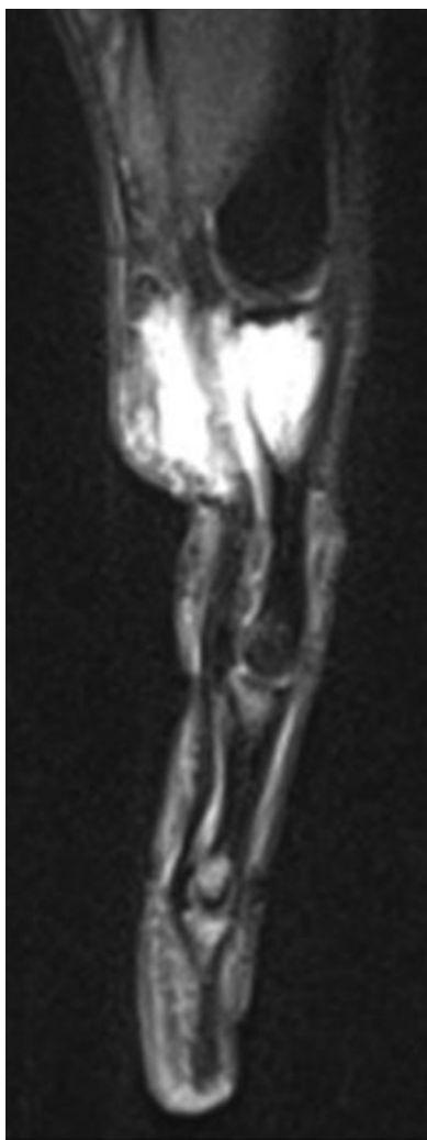
Fig. 3 Nuclear magnetic resonance, T2, endomedullary tumor invasion extending to the soft tissue.

Intralesional biopsy of the soft tissue mass of the volar and cubital region of the 4th ray of the left hand was performed on November 8, 2012. The histological and immunohistochemical diagnosis was neurothekeoma.