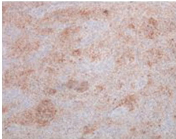
Fig. 7 Photomicrograph of neurothekeoma with immunohistochemical staining for protein S100 (100 ×).

with other nervous tissue tumors, such as Schwannoma or neurofibroma, it is a distinct clinicopathological entity. 4