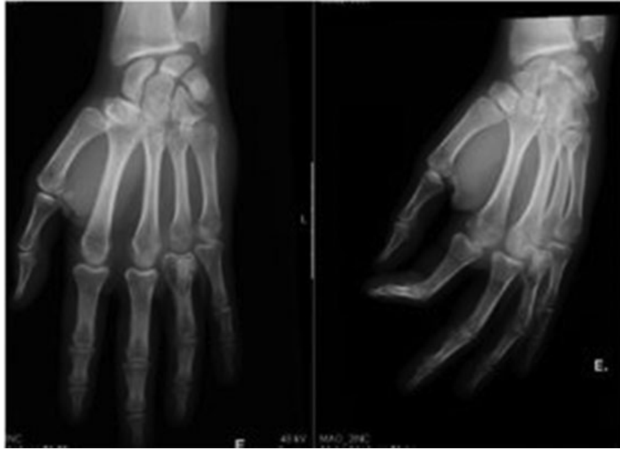
Fig. 6 Postoperative X-ray with visualization of autologous cortico-cancellous bone graft.