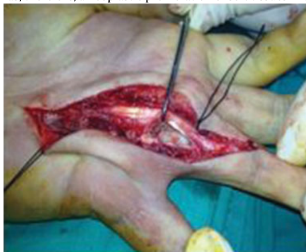
Fig. 5 Intraosseous tumor lesion with cortical destruction.

was, therefore, a neoplastic proliferation of soft tissues with