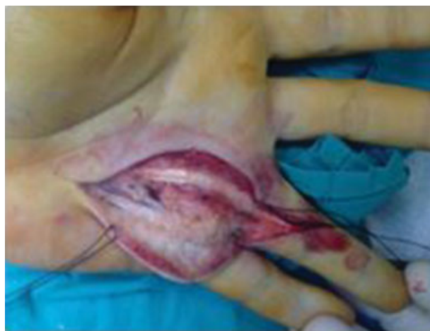
Fig. 4 Soft tissue tumor invasion surrounding the flexor tendons.

Macroscopic examination of biopsied fragments revealed nodular formations consisting of whitish and firm tissue. Microscopically, the nodular areas comprised cell proliferation with relatively monomorphic, oval-shaped nucleus, with thin chromatin, showing eosinophilic cytoplasm of ill-defined limits. Multifocally, glomeruloid cell aggregation was observed centered by a small blood capillary. Proliferation was negative for epithelial membrane antigen (EMA) but was strongly immunoreactive for S100 protein. (► Fig. 7 ). It