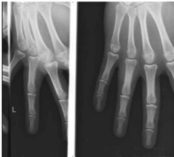
Fig. 1 Radiological control in the hospital of origin follow-up, in 2010.

We report the case of a 16-year-old male, referred to our hospital in 2012 for a suspected giant cell tumor of the flexor tendon sheath of the fourth finger of the left hand, relapsed after a marginal resection 2 years before (▶Fig. 1).