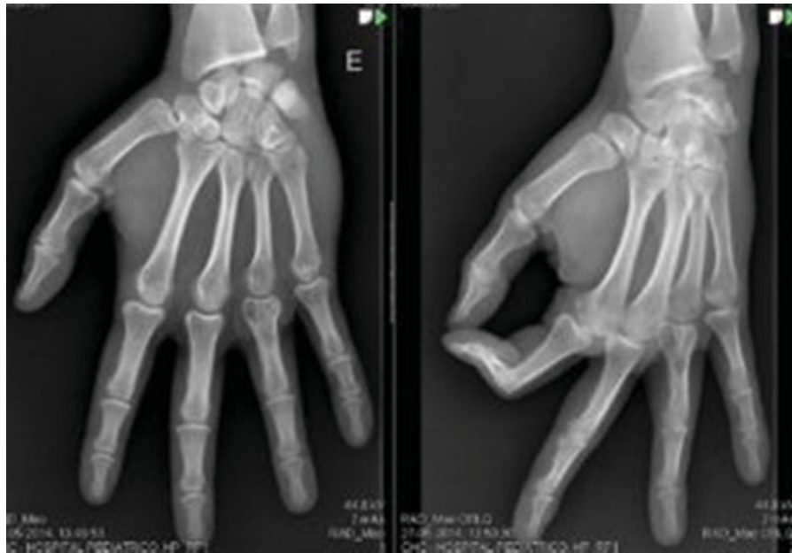
Fig. 8 Control after 17 months postoperatively.