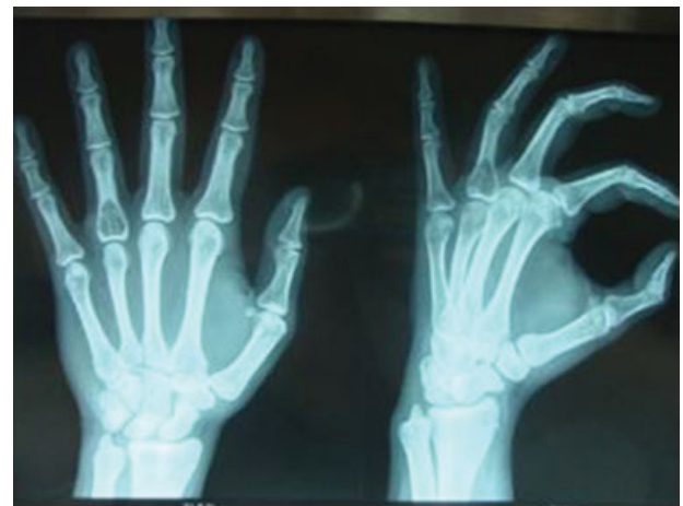
Fig. 2 Intraosseous lesion, lytic, septate, with cortical insufflation, located at the base of the proximal phalanx of the 4th finger of the left hand.

On the magnetic resonance imaging (MRI) performed on October 31, 2012, the posterior aspect of the flexor tendons of the 4th finger presented a lobulated tumor lesion with epicenter in the bone marrow of the 4th finger proximal phalanx, T1-hypointense, hyperintense and slightly heterogeneous on T2 and proton density (PD) weighted images (▶Fig. 3). This lesion conditioned marrow insufflation of the proximal portion of the first phalanx of the 4th finger, with apparent cortical rupture and erosion, wrapping and surrounding the flexor tendons, especially in its posterior and anterointernal aspects.