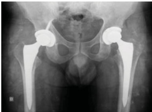
Fig. 4 Anteroposterior radiograph of the postoperative pelvis.

phenytoin and tonic-clonic contractures, the seizure was not the cause, but the triggering event of the fractures.