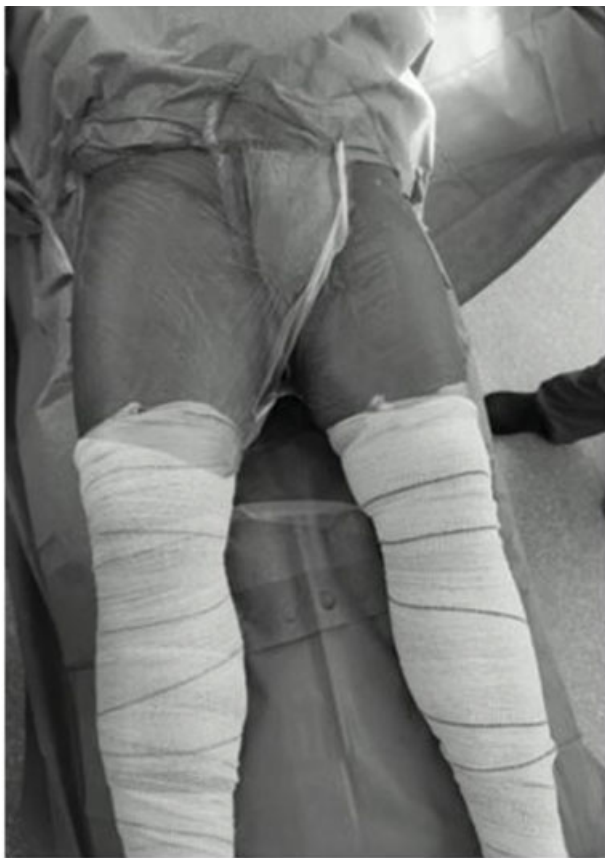
Fig. 3 Patient Positioning and Preparation.