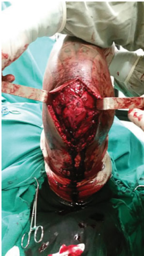
Fig. 3 Final configuration of the reinforcement made with long palmar muscle tendon graft.