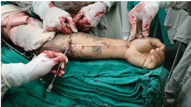
Fig. 2 Graft removal (long palmar muscle tendon).