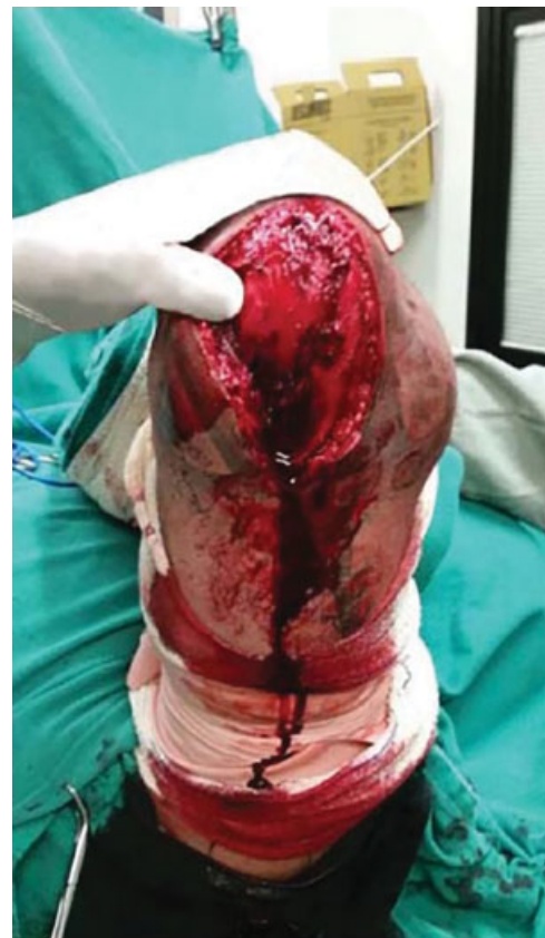
Fig. 1 Posterior surgical approach.

The patient was evaluated using an isokinetic dynamometer (CybexII+, New York, NY, USA) both preoperatively and 5 months after surgery. Flexion-extension was evaluated. The right arm was used as the control side.