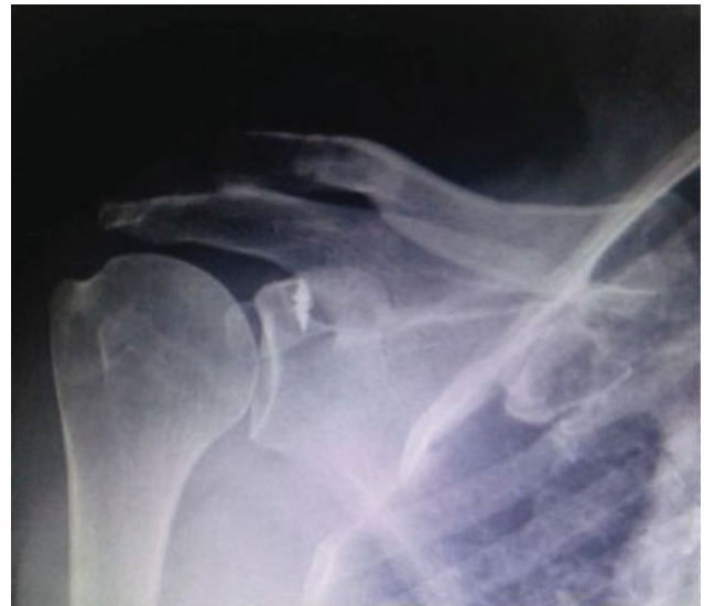
Fig. 5 Nine months postsurgery, right shoulder.

Thus, a new surgical procedure was performed to remove the metallic wire from the left shoulder.