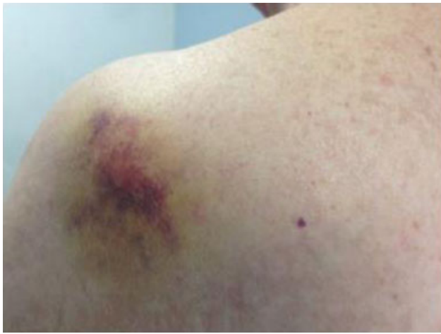
Fig. 2 Hematoma and a small skin protuberance, left shoulder, 9 months after the procedure.