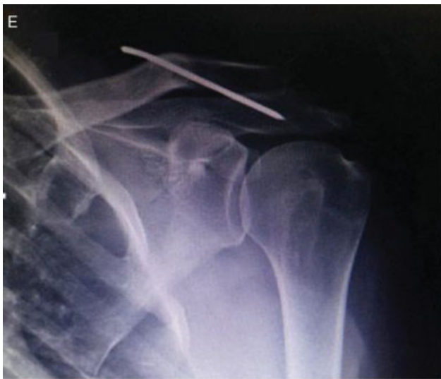
Fig. 4 Nine months postsurgery, left shoulder.

The patient was asked about additional symptoms and he mentioned a discomfort in the posterior cervical region during the previous weeks.