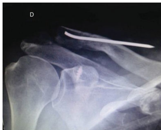
Fig. 1 Fifteen days postsurgery, right shoulder.

The patient did not show up for his 6-month visit. Nine months after the surgical treatment, the patient started to present with pain on the left shoulder (contralateral side), reduced arc of movement, ecchymosis, and a protrusion (►Figs. 2 and 3). Bilateral radiographs showed that the Kirschner wire originally from the right shoulder was in the left shoulder (►Figs. 4 and 5).