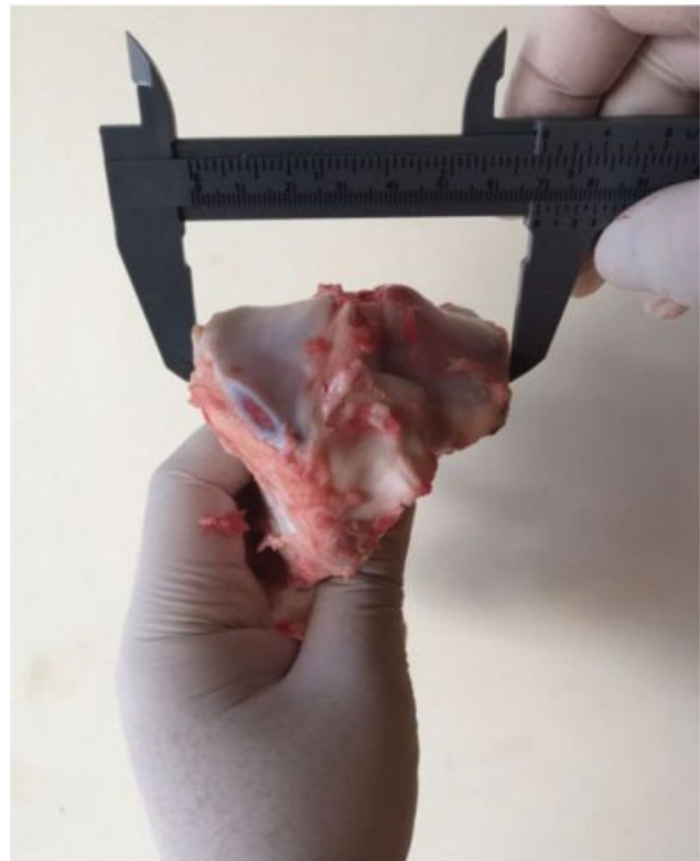
Fig. 3 Plateau width.

Tendon graft fixed with a 5 mm anchor and 5 surgical knots 19 with Ultrabraid wire – Pauchet technique – and