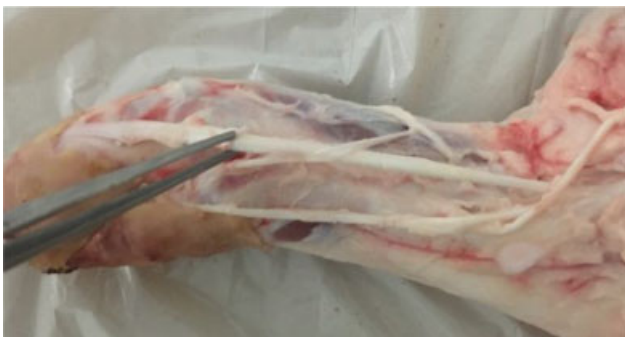
Fig. 2 Graft preparation.