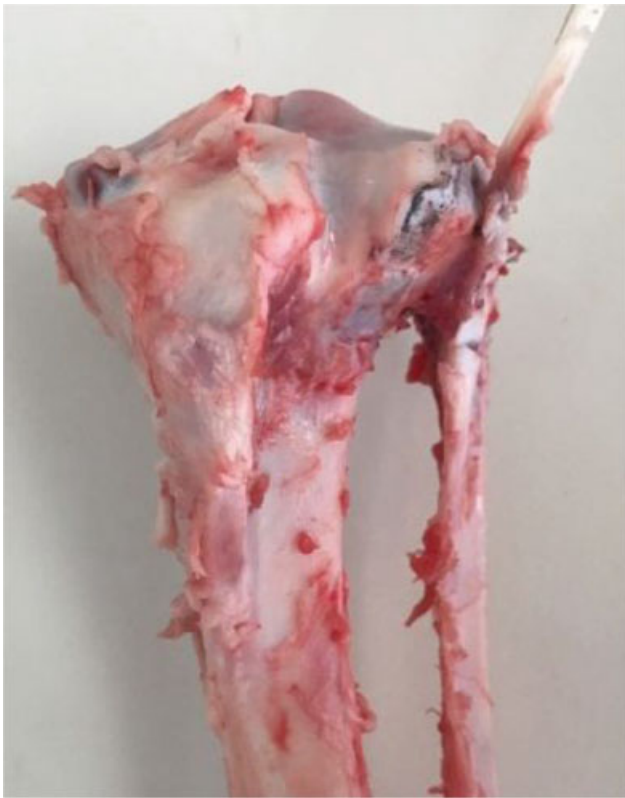
Fig. 1 Tibia preparation.