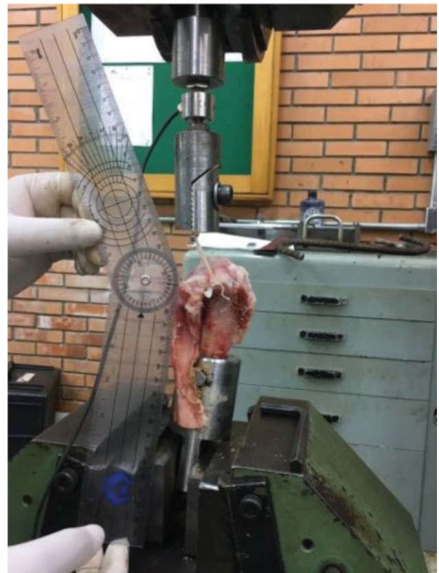
Fig. 5 Tibia position during tests.

The sample size was determined from data from previous studies. 9,21,22 The tensile strength was compared between groups with an F test (analysis of variance [ANOVA]) with multiple size comparisons. Data normality and equality of variances hypothesis were respectively determined by the