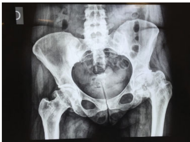
Fig. 1 Posterior-anterior hip radiography—bilateral coxarthrosis and lower left limb shortening.

The patient was submitted to a spinal anesthesia with codeine analgesia, with no motor block. In right lateral recumbency position, electroencephalographic monitoring electrodes were placed and successive evoked potential tests