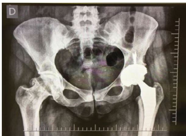
Fig. 3 Demonstrative photograph of residual dysmetria in postoperative malleolar evaluation.

Gluteus maximus tenotomy is described for the treatment of deep gluteal pain, which can result from non-discogenic compression (sciatic nerve compression). 5 The description of this procedure as a protective measure against sciatic nerve injury during THA (as presented by the authors) requires studies with greater scientific evidence. Nevertheless, the electro-neurophysiological results presented here support us to stimulate large centers in performing prospective clinical studies to ratify these results.