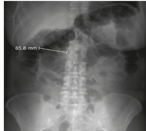
Fig. 2 – Plain abdominal radiography showing dilatation of the transverse colon.

The diagnosis of TM is established when we had 3 of the 4 criteria below: 1) Temperature > 38.6 °C, 2) Tachycardia (> 120 bpm), 3) Leukocyte count > 10,500 mm 3 with left shift, and 4) Anemia (hemoglobin or hematocrit < 60 % of normal) (Table 1). 8,9