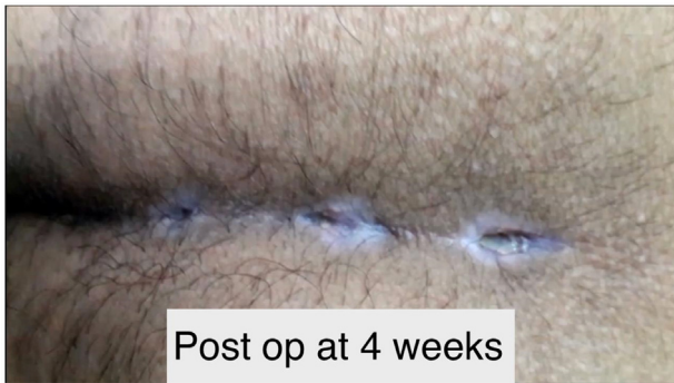
Fig. 3 – Post operative after 4 weeks.