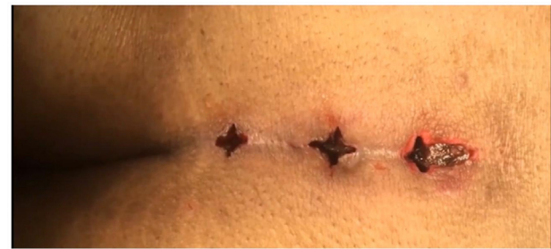
Immediately after Laser Pilonidotomy