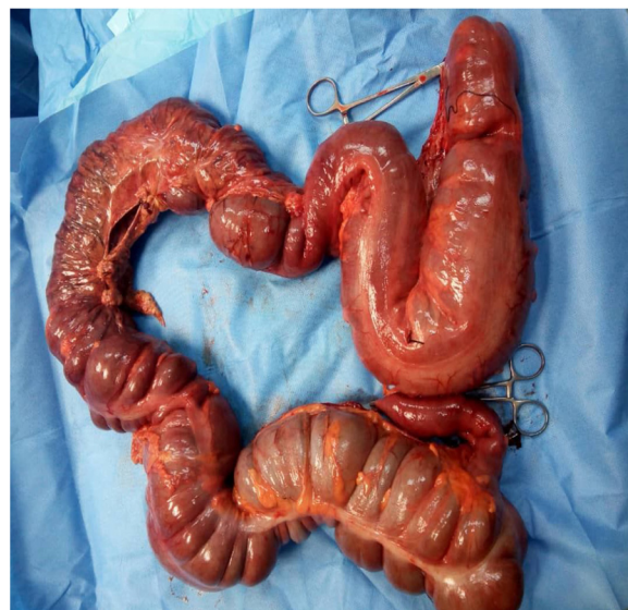
Fig. 2 – Total colectomy.

Biopsy results: 1, 2 and 3 mucosal fragments with exacerbated chronic inflammation. Absence of myenteric plexus in all samples.