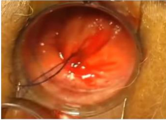
Fig. 1 – Rectal closure above the pectineal line.

Thoracoabdominal Computed Tomography (CT) and pelvic Magnetic Resonance Imaging (MRI) were routinely used for patient staging. In the Stage I patient, anorectal ultrasound was also used for assessment of anal canal morphology. All subjects underwent complete videocolonoscopy examination, with synchronous lesions found in one patient. Serum Carcinoembryonic Antigen (CEA) levels completed the staging process.