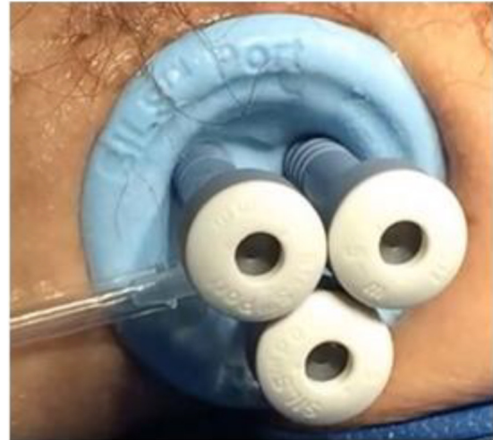
Fig. 2 – SILS ™ Port device inserted.

In 8 cases it was possible to perform stapled anastomosis with EEA HEM ® 33 mm–4.8 mm stapler (Medtronic Inc,