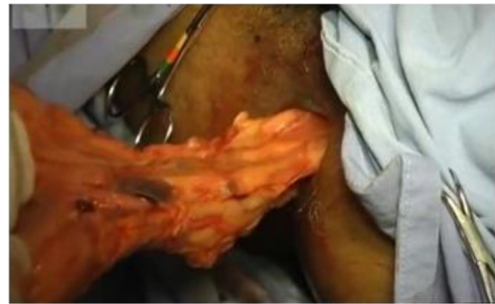
Fig. 3 – Transanal surgical specimen removal.

Dublin, Ireland). In these cases, shortly after the specimen removal, suture in the remnant colon bag was performed and the stapler warhead was fixed. The EEA HEM ® anoscope portal was then placed and fixed to the skin and the distal stump pouch was sutured. Finally, the warhead was attached, followed by the stapler closure (Fig. 4a-c), and the pneumoperitoneum was redone. The position of the lowered colon was checked and a final revision of the abdominal cavity was performed, as well as the repair of the ileum loop to make a protective ileostomy. Then, pneumoperitoneum was undone, stapling was performed, and stapled line was checked, transanally, in order to make reinforcement and/or hemostatic points whenever necessary.