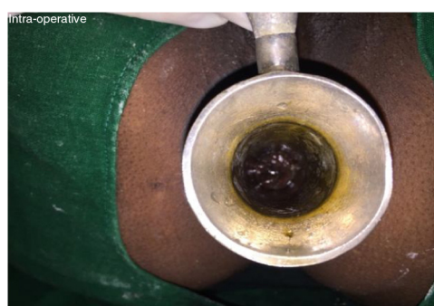
Fig. 8 - After circumferential Kshara application.