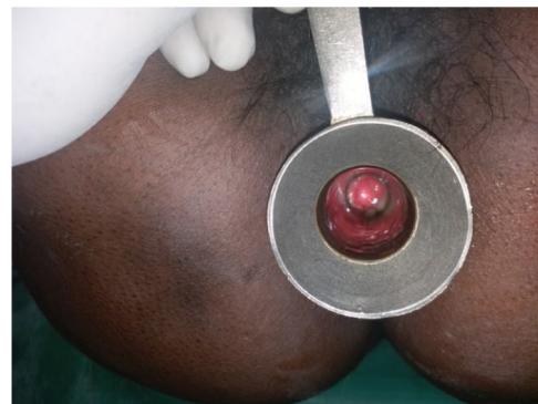
Fig. 9 – (AT) Proctoscopy examination.