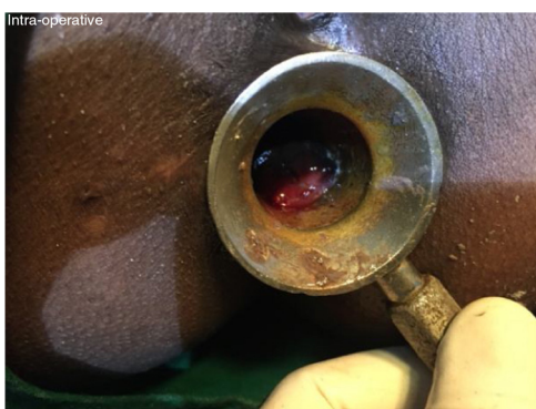
Fig. 3 - Kshara application.