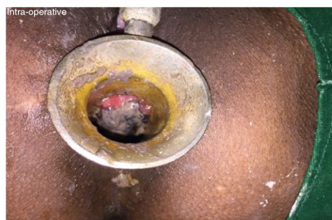
Fig. 6 - Kshara application.