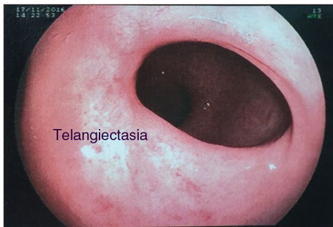
Fig. 3 – Endoscopic aspect of a patient with complete clinical response.

thus greater local and distance control, as well as better PFS and OS. 8 Considering this data, the real need for surgery in this group was questioned; Dr. Angelita Habr-Gama, from Brazil, was the first to conduct a study in order to elucidate this question and to experimentally adopt the wait-and-see policy (no surgical resection and vigilant follow-up).