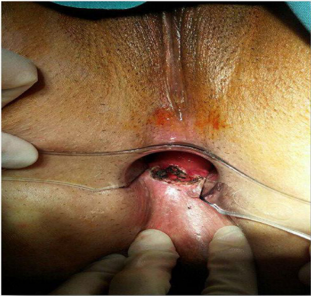
Fig. 2 – Fissurectomy.