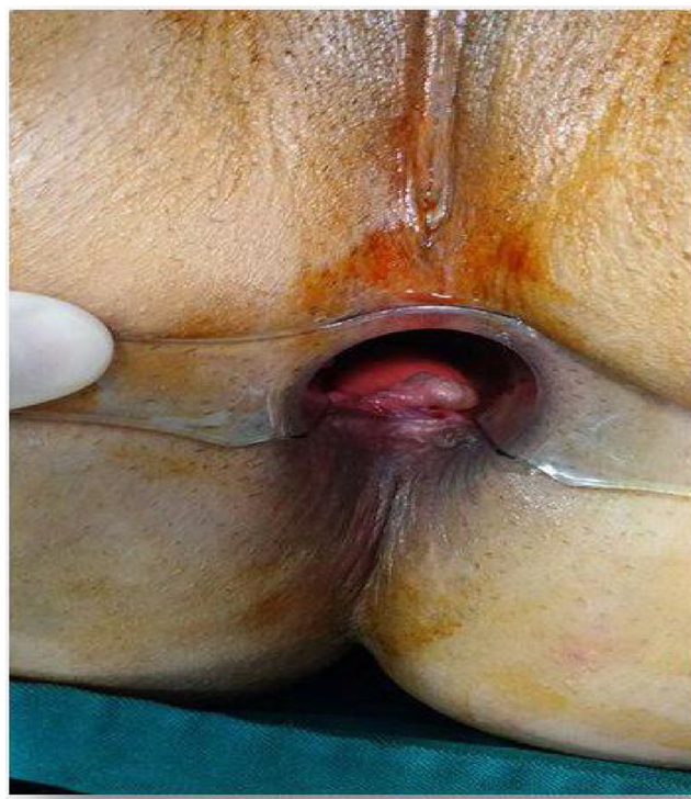
Fig. 1 – Chronic anal fissure.

Exclusion criteria included atypical fissure such as multiple, irregular and off the midline fissures, syphilis, tuberculosis and malignant disease.