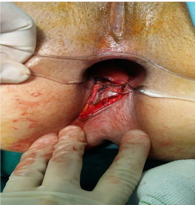
Fig. 3 – Fissurectomy and V-Y advancement flap.