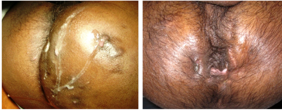
Fig. 1 – Clinical photographs showing caseating discharge from multiple external openings of tubercular fistula (left) and recurrent fistula in ano with multiple external openings and stenosis at anorectal junction (right).