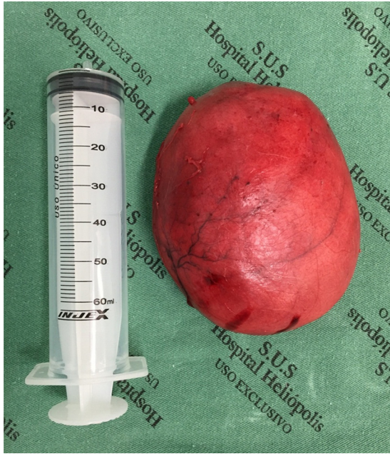
Fig. 2 – Surgical specimen after tumor resection.

increased number of mitoses (>2 mitoses per field, with a 10× increase). 3,9