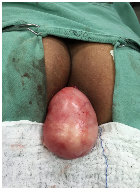
Fig. 1 – Patient in the ventral position with tumor extrusion from the perianal region on the right, near the anal verge.

First described by Virchow in 1854, and histologically confirmed by Malassez, in 1872, leiomyomas are benign tumors of mesenchymal origin and can develop where the smooth muscle is present. 3,5 They are more common in the female genital tract and skin. In the anorectal region, they represent only 3% of all leiomyomas of the gastrointestinal tract and less than 0.1% of rectum tumors, rarely found in soft tissues, mainly in