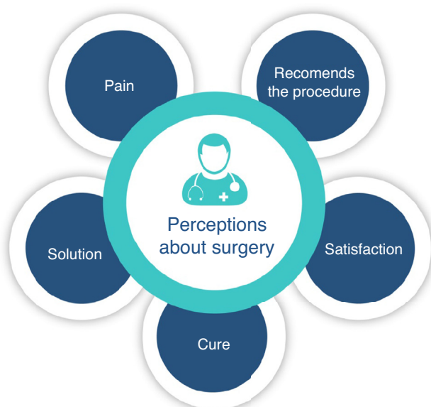
Fig. 5 – Perceptions of the patient about hemorrhoidectomy.

recommend the treatment. It was also observed that, through micropolitics at all levels covered in the health system, this treatment will be announced, and an increasing number of people will have access to it. 19,20