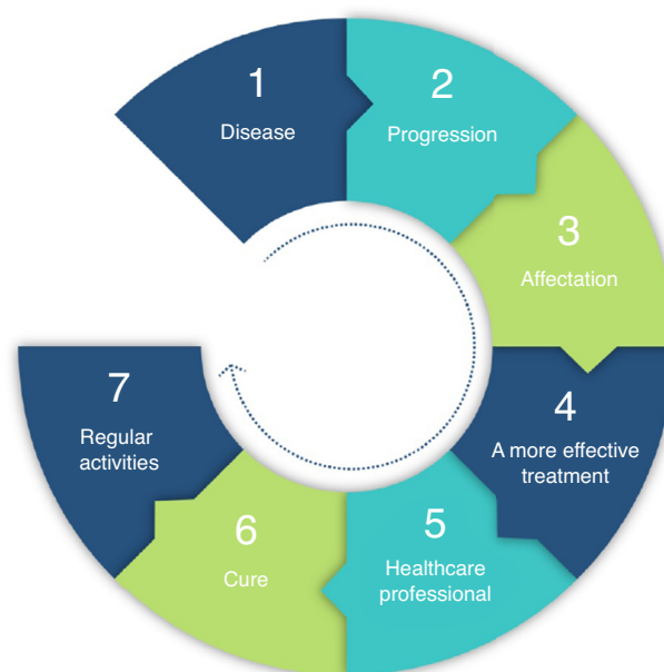
Fig. 2 – Flexible lines.

empirical treatments, which makes it difficult to carry out an event or affectation that can change the flow of these hard lines to flexible or escape lines. 21,22