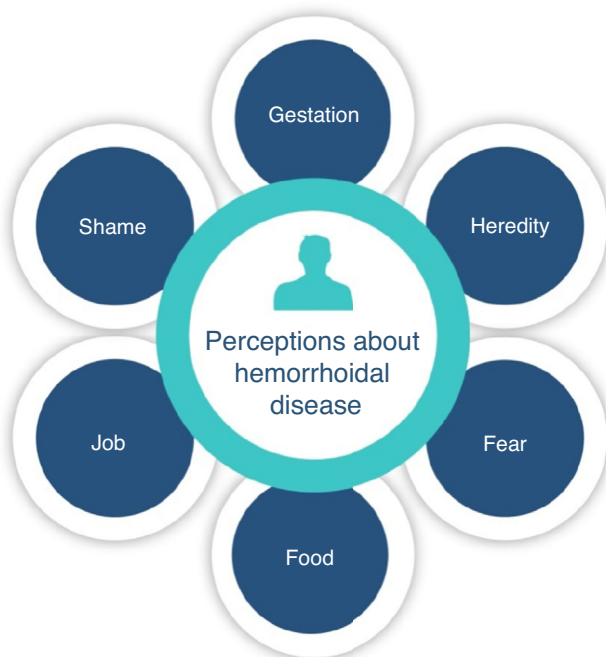
Fig. 3 – Perception of the patient about hemorrhoidal disease.

a limiting cause for achieving a plan of immanence, freeing patients from disease and decreasing its potency. 19,20