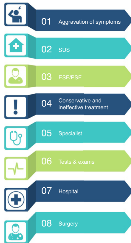
Fig. 4 – Trajectory of patients submitted to hemorrhoidectomy.

"I was lucky because it seems that some person was quitting the procedure; thus, they sent me over, in the place of that person." (E9)