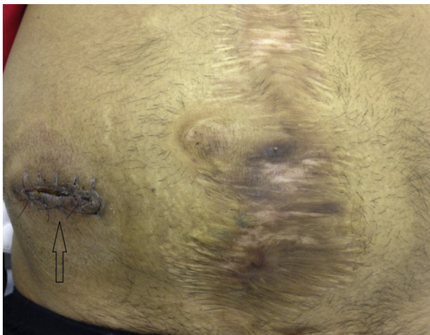
Fig. 3 – Final appearance of the abdomen. Arrow, ITR incision.

incised surgeries are a good choice in some situations, such as in the reconstruction of intestinal transit, as an alternative to videolaparotomy, which present a very varied incidence in the literature with regard to conversion rates in the presence of large numbers of firm intra-abdominal adhesions, as in the case described in this paper. 8