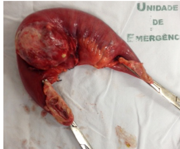
Fig. 2 – Resected segment of jejunum evidencing a large diverticulum with marked inflammation.

Most patients with JID are asymptomatic. Forty percent, however, experience non-specific symptoms such as vague