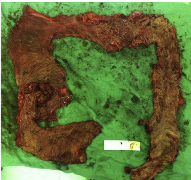
Fig. 3 – Product of a total colectomy: 62 hamartomatous polyps.

greater than 5 mm. 14,15 The use of capsule endoscopy is considered as a good method for searching the small intestine. 16 Another less expensive but less sensitive option is the CT scan with oral contrast. 17 The double-balloon enteroscopy is a great option, when therapeutically associated; but this procedure is too invasive for control or scanning procedures. 2