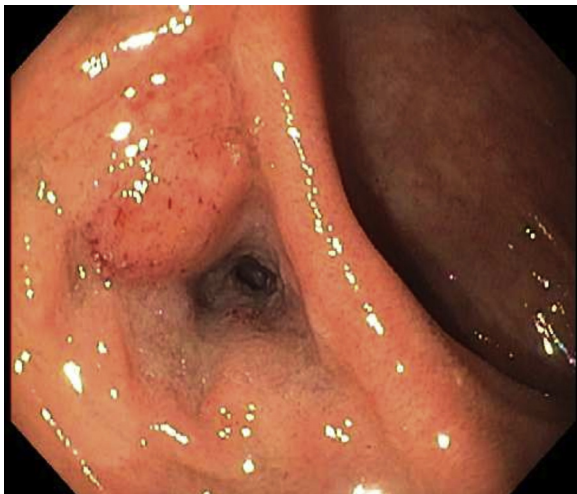
Fig. 3 – Endoscopic view of the leak at the tip of the J-pouch.

Leaks from the suture line of the pouch body, anastomosis, or the tip of the J-pouch can occur. However, it was suggested that the risk of pouch failure is significantly higher when a septic complication occurs in the tip of “J”. 4 The reported prolonged interval between primary pouch surgery and the detection of leak at the tip of the J-pouch suggests that this disease