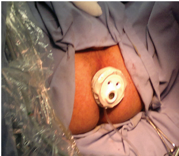
Fig. 1 - Single-site laparoscopic (SSL™) access system, Ethicon Endo-Surgery, Cincinnati, OH, USA).

All patients were hospitalized. All immediate and late complications were recorded. All patients included in the study underwent a rigorous follow-up and if they had invasive carcinoma, they were submitted to oncological follow-up, including anoscopy, rectoscopy, serum Carcinoembryonic Antigen (CEA) levels and imaging assessment.