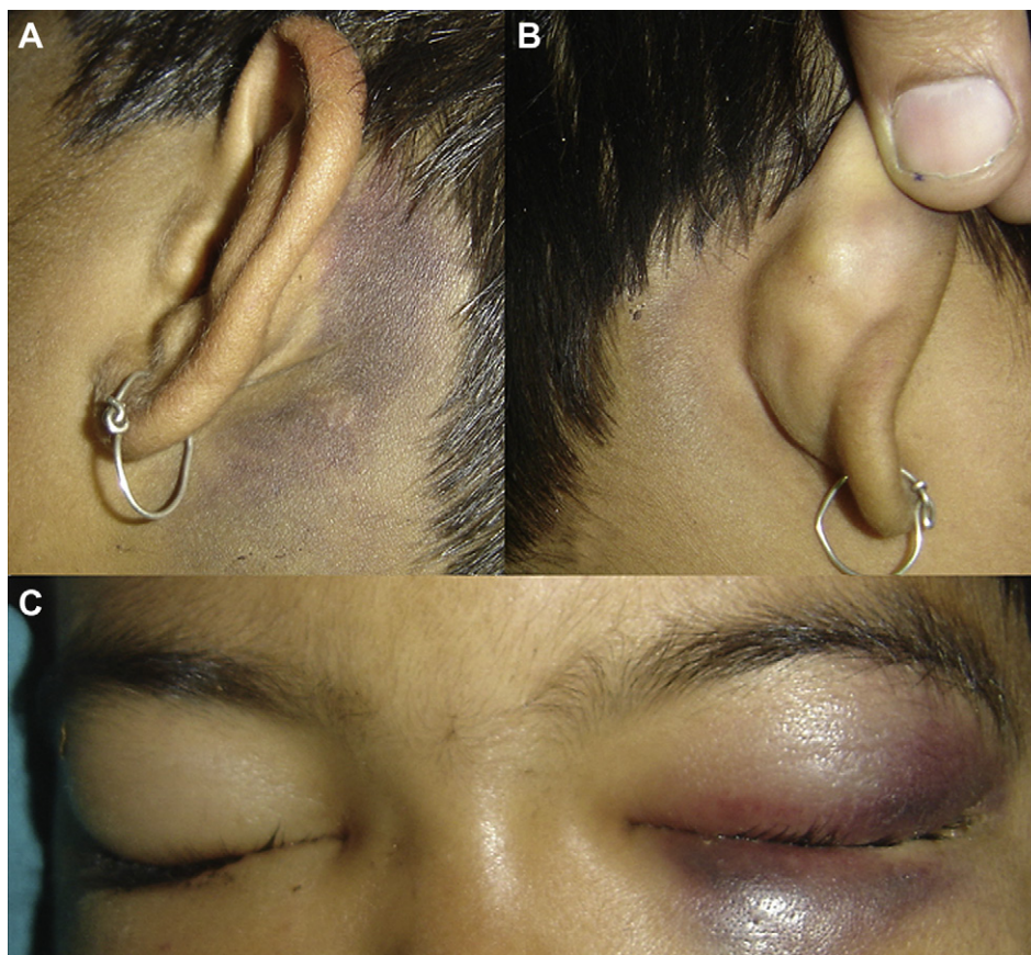
Fig. 1 – Clinical photograph showing bluish discoloration over the mastoid processes (A and B) and bilateral black eye (C).

suspected. However when the child regained consciousness (after three weeks of injury), she admitted that she was hit by her fellow colleague.