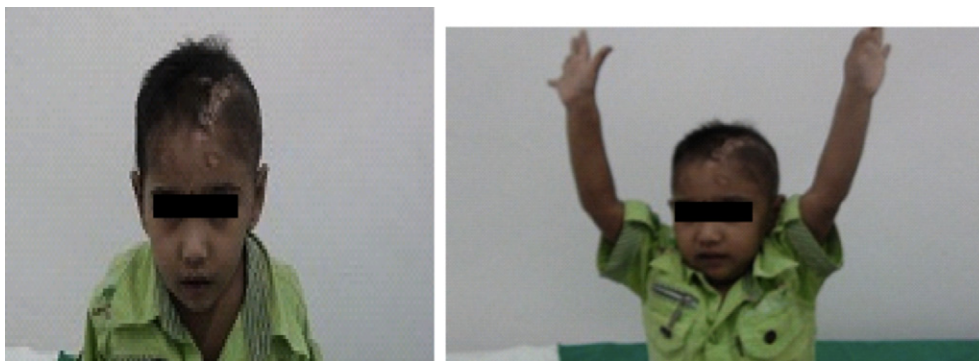
Fig. 2 – Child with no significant deficit post-cranioplasty.

refrigeration. The patient was electively ventilated thereafter for 72 h.