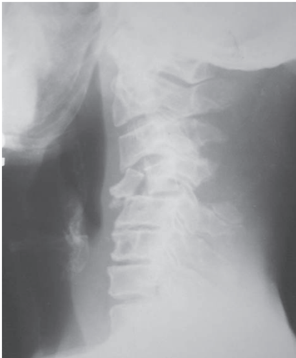
Fig 1: X-ray cervical spine showing C4 fracture

A 28-year-old male fell from a two-wheeler and was admitted with constant neck pain and restriction of cervical spine movements. There was no neurological deficit. Cervical spine radiograph and CT cervical spine revealed vertical coronal fracture of the C4 vertebral body (Figs 1 & 2), with anterior displacement of the fractured fragment. Posterior cortex and spinal canal were uninvolved. He also had fracture of spinous process of C4 vertebra.