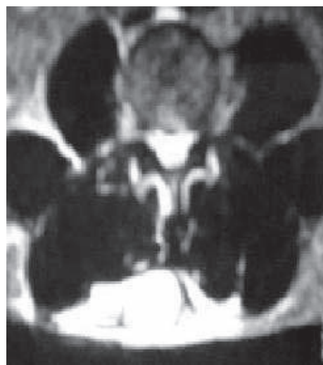
Fig 2: Axial MRI showing haematoma