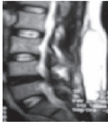
Fig 1: MRI showing haematoma

This constitutes a rare complication of spinal trauma and need to be recognized in time, as its excision is associated with good prognosis.