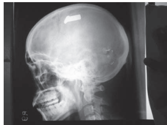
Fig1: Plain x-ray skull showing Bullet in frontal lobe

and small hematomas seen in the frontal and parietal lobes (Fig-1). Fracture could be seen at site of entry in the left occipital region. The entry wound was debrided and stitched. Patient was treated conservatively with antibiotics, antiepileptics and anti edema measures. On this aggressive anti edema therapy patient showed initial improvement but on 4 th day, repeat scan showed migration of the bullet to the posterior left occipital region with thin streak of bleed along the suspected track of migration (Figs - 2a and 2b). On fifth day of admission the patient had worsening of neurological status, following which a CT was done. This time the bullet had migrated further posteriorly to lie at the site of entry of the firearm wound (Fig-3). The edema and midline shift had increased. Patient was taken up for surgery. Intraoperatively the bullet's location was confirmed with fluoroscopic guidance after positioning of the patient. Surgery was performed in two steps: first the site of gunshot was explored. The fractured bony segments were