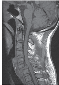
Fig 2b : MRI of the same patient