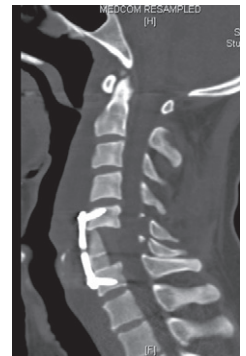
Fig 2 c : Postoperative NCCT C spine of the same patient

Surgical Management: Mean duration from injury to surgery was 11 ± 5.6 days. Majority of them (89.3%) were approached anteriorly. Four patients (5.3%) were operated through posterior approach. Combined anterior and posterior approach was used in 2 patients.