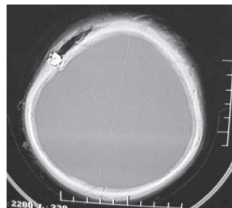
Fig 2: Bone window of CT head showing the depressed bone segment.